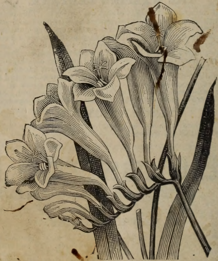
TYPE OF FREESIA.

The double Poeticus flowers are large and very fragrant. They can be forced slowly, but succeed better in the open ground. $1.25 per hundred.